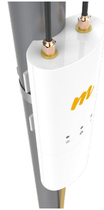
C5c on Pole

**4.9 GHz uses 20 MHz channel widths (US only, regulations vary by region)