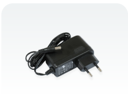
24 V 0.38 A power adapter